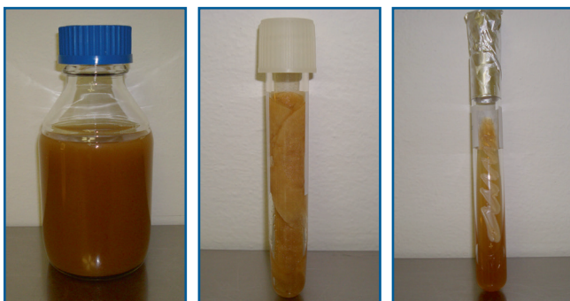
pure liquid yeast culture